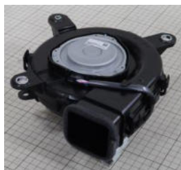
External appearance of cooling blower