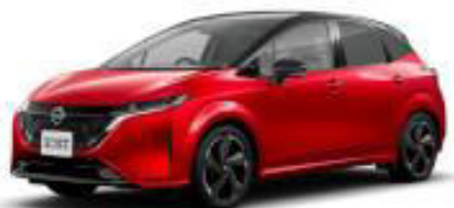
NISSAN NOTE AURA