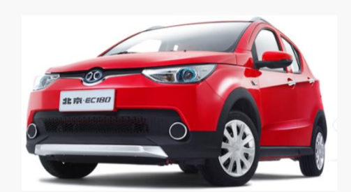
EC180 EV manufactured by Beijing Automobile Works Co., Ltd. (BAW)

February 2020. This is a teardown report of the Zhuhai Enpower inverter found in Beijing Automobil Works' EC180 electric vehicle.